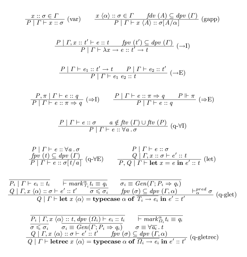
Fig. 6. Type checking rules for Generic Haskell with Qualified types.